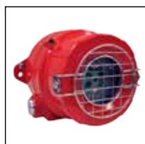
Multi-Spectrum UV/Dual IR/VIS Fire and Flame Detector